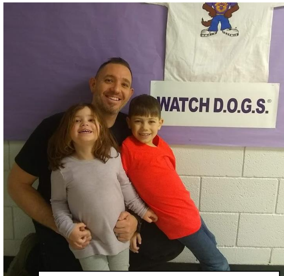
Thank you WATCH DOGS for being in the building!

Roundup: Kindergarten and preschool roundup is scheduled for April. Please check out the flyer below. We will start making appointments after spring break. Spread the word!